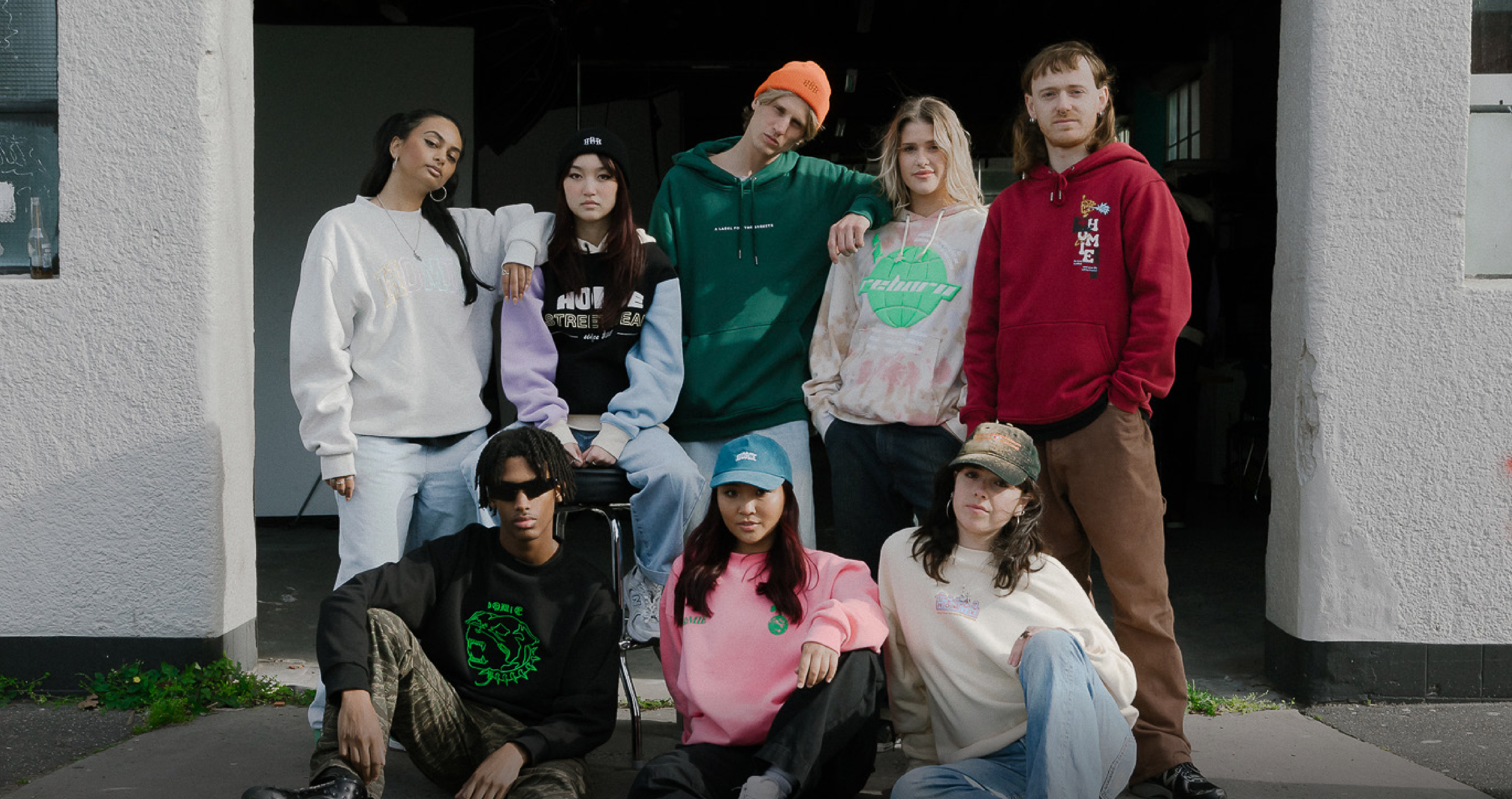
Homie, a social enterprise supporting young people affected by homelessness or hardship to equip them with skills, confidence, and experiences to be more work-ready and better prepared for their future.