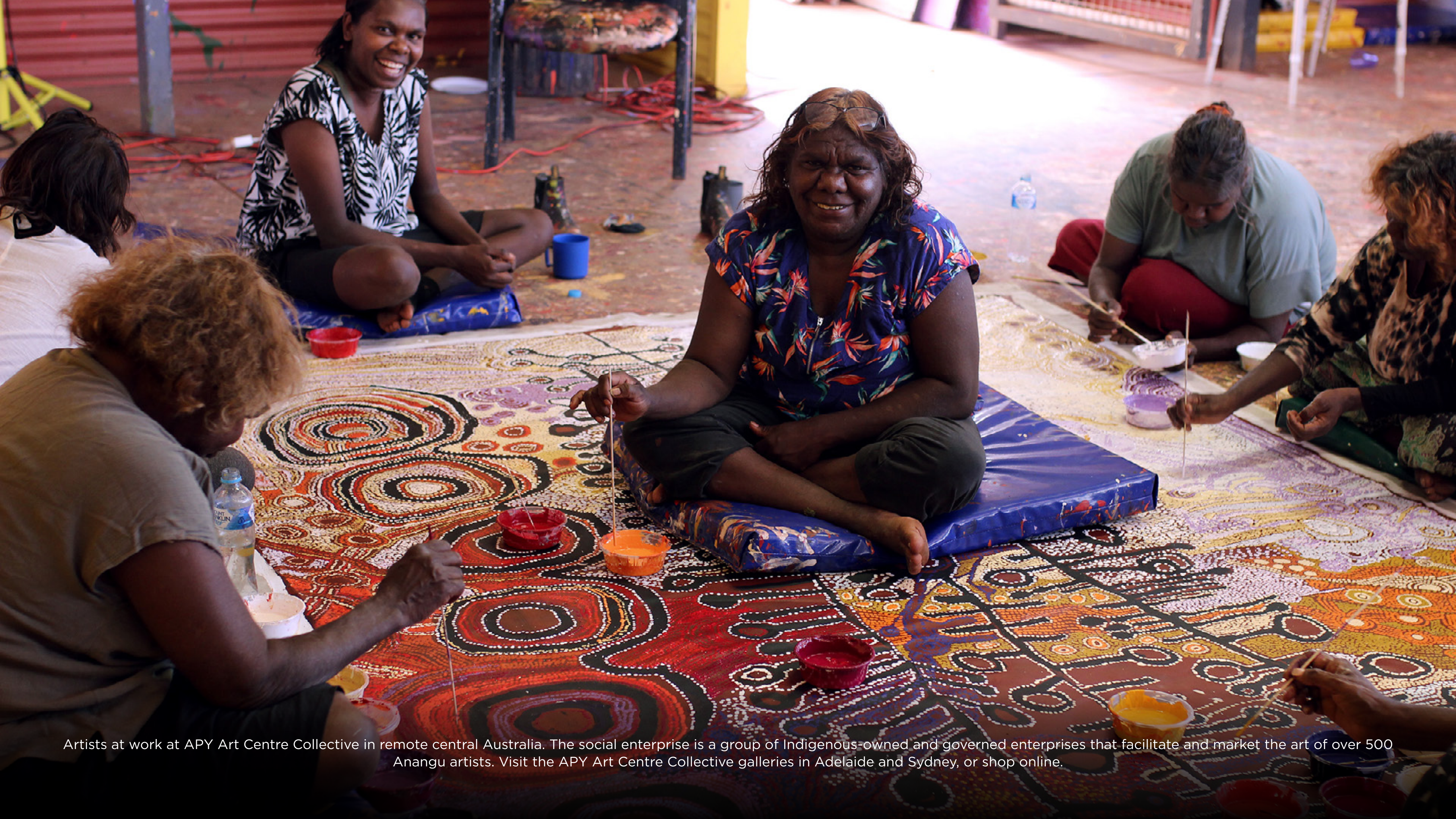
Artists at work at APY Art Centre Collective in remote central Australia. The social enterprise is a group of Indigenous-owned and governed enterprises that facilitate and market the art of over 500 Anangu artists. Visit the APY Art Centre Collective galleries in Adelaide and Sydney, or shop online.