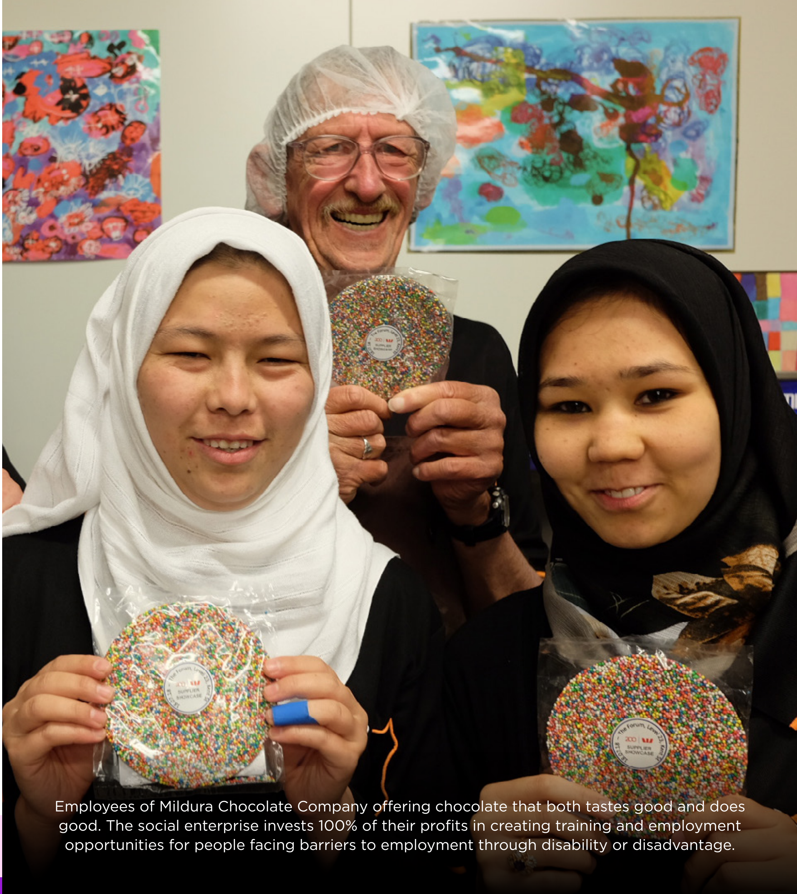
Employees of Mildura Chocolate Company offering chocolate that both tastes good and does good. The social enterprise invests 100% of their profits in creating training and employment opportunities for people facing barriers to employment through disability or disadvantage.