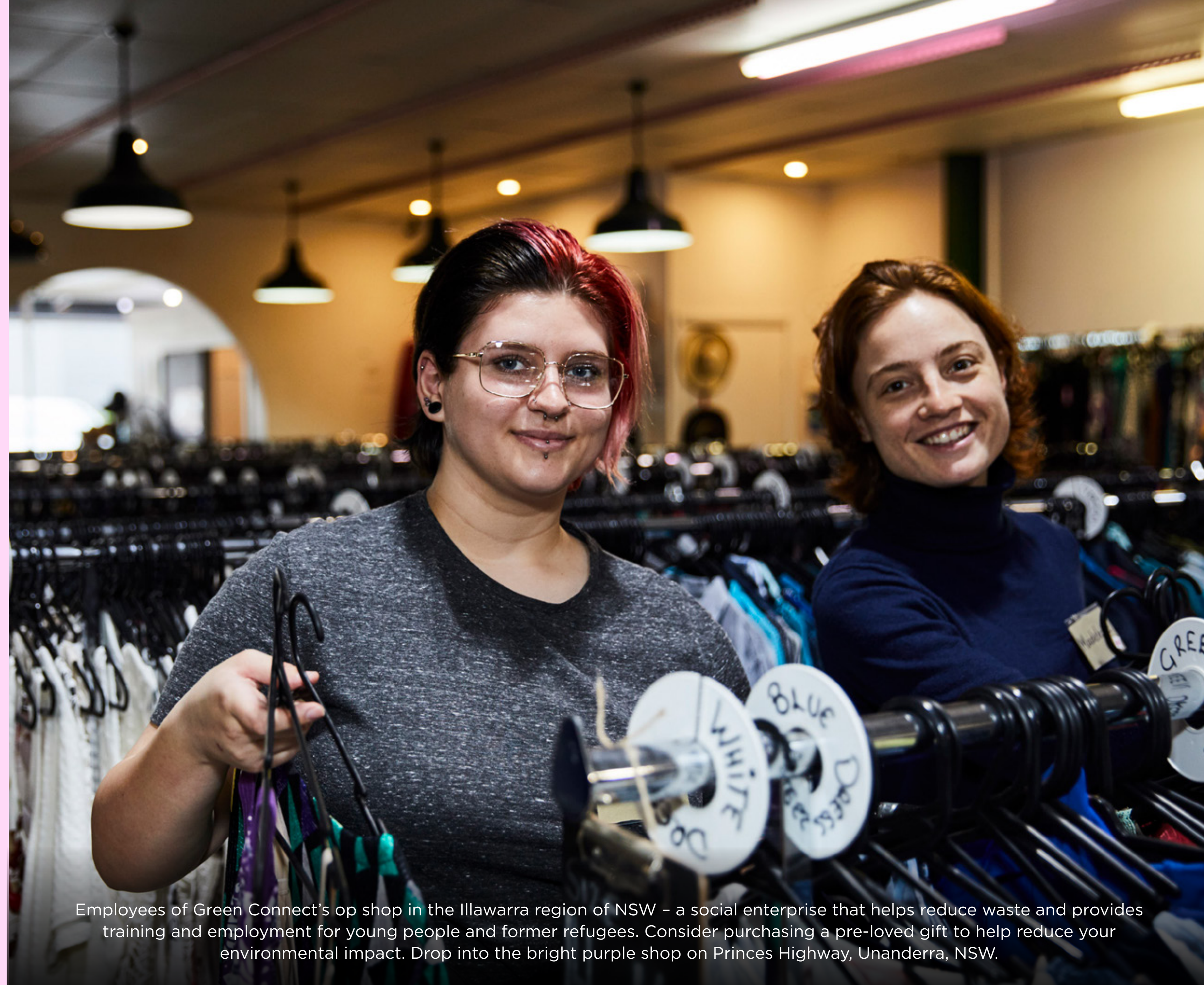
Employees of Green Connect's op shop in the Illawarra region of NSW – a social enterprise that helps reduce waste and provides training and employment for young people and former refugees. Consider purchasing a pre-loved gift to help reduce your environmental impact. Drop into the bright purple shop on Princes Highway, Unanderra, NSW.

They operate in all sectors of the community from retail to catering and hospitality, and what makes them unique is that they exist to create impact through trade.