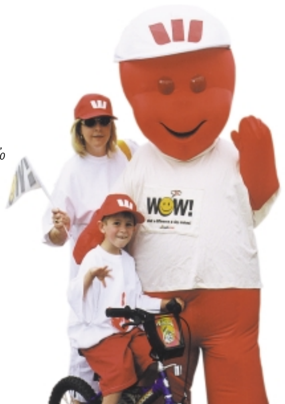
Amy Winters Paralympic athlete