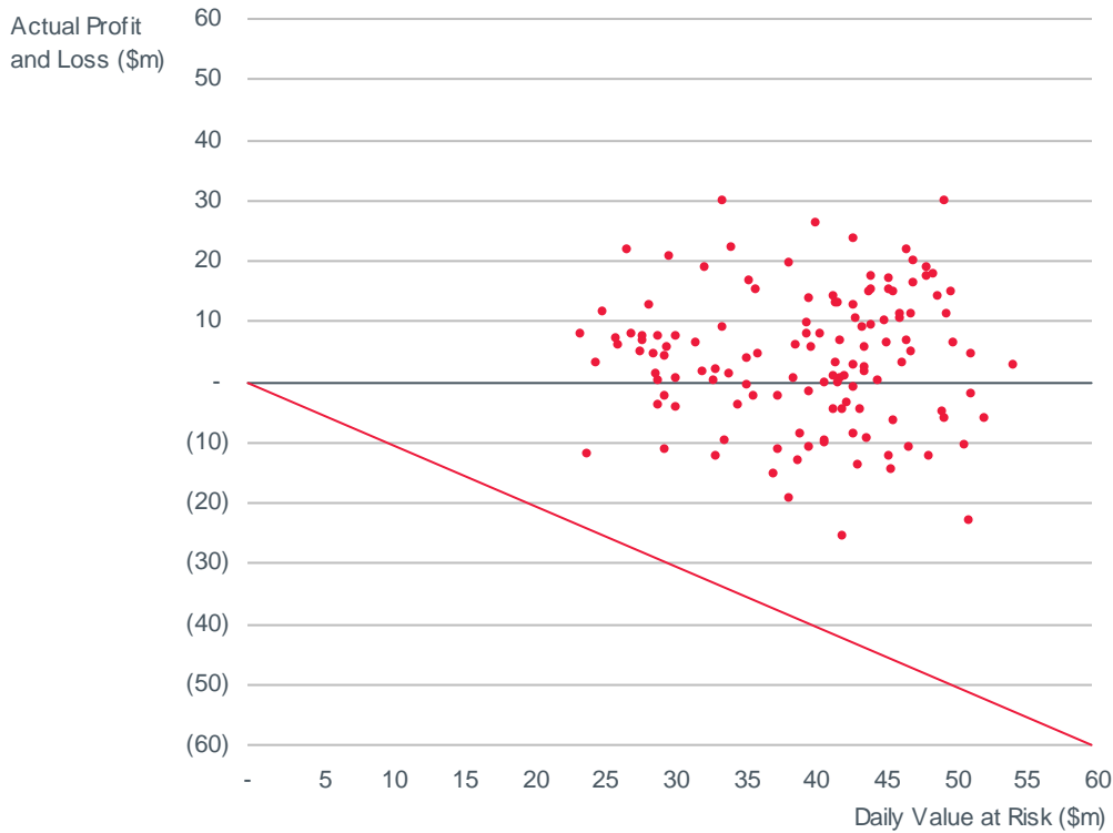
Traded Risk: Actual Profit and Loss vs. VaR 1 April 2009 to 30 September 2009

Each point on the graph represents 1 day's trading profit or loss. This result is placed on the graph relative to the associated VaR utilisation. The downward sloping line represents the point where a loss is equal to VaR utilisation. Any point below this line represents a back-test exception (i.e. where the loss is greater than the VaR). There were no outliers identified in back-test results for the 6 months ended 30 September 2009.