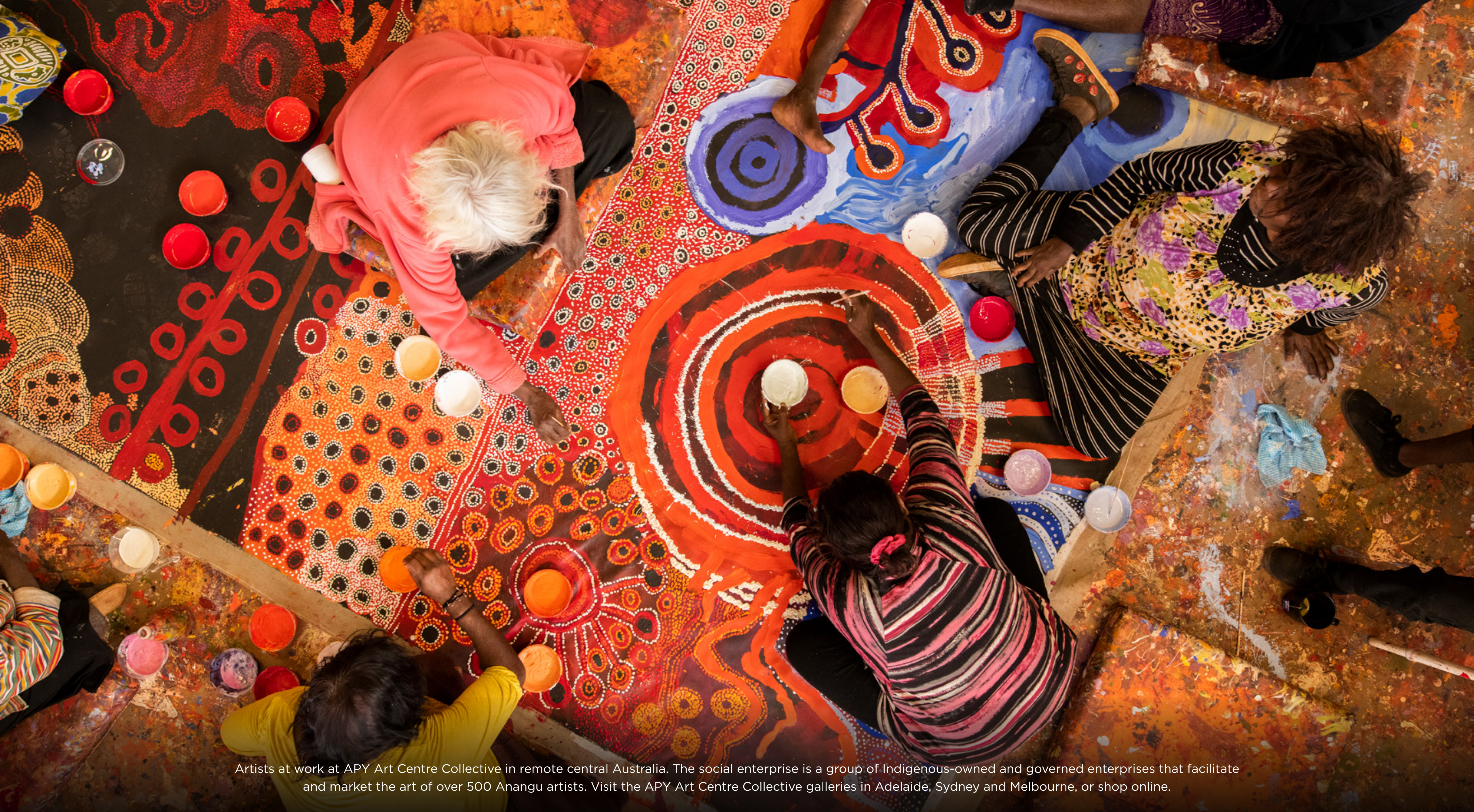
Artists at work at APY Art Centre Collective in remote central Australia. The social enterprise is a group of Indigenous-owned and governed enterprises that facilitate and market the art of over 500 Anangu artists. Visit the APY Art Centre Collective galleries in Adelaide, Sydney and Melbourne, or shop online.