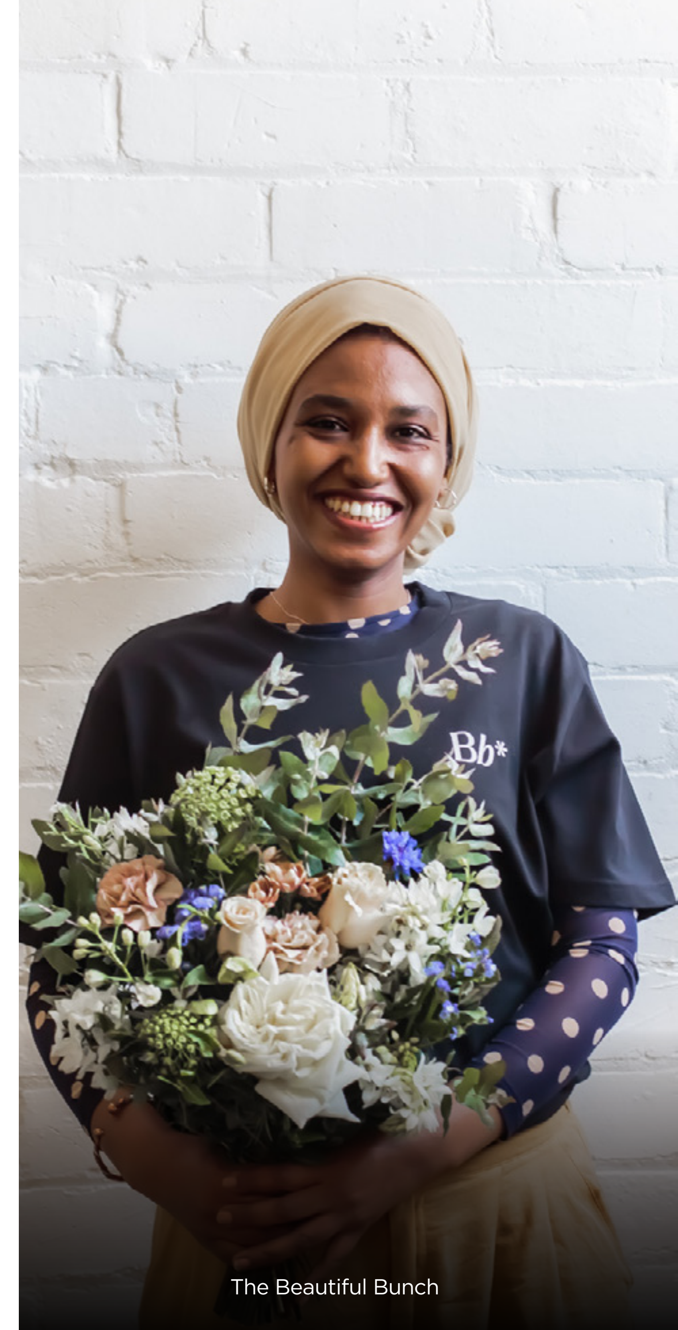
The Beautiful Bunch