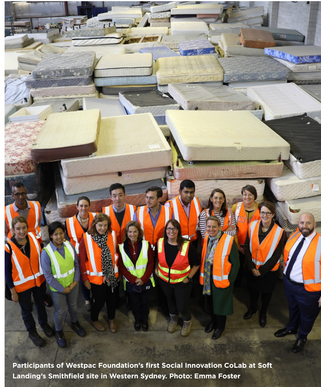
Participants of Westpac Foundation's first Social Innovation CoLab at Soft Landing's Smithfield site in Western Sydney.

The volunteers were so passionate about the opportunity that they spent much of their spare time on the project. What's more, while the CoLab process has finished, some of the volunteers have continued to work with Soft Landing to help bring further solutions to life.