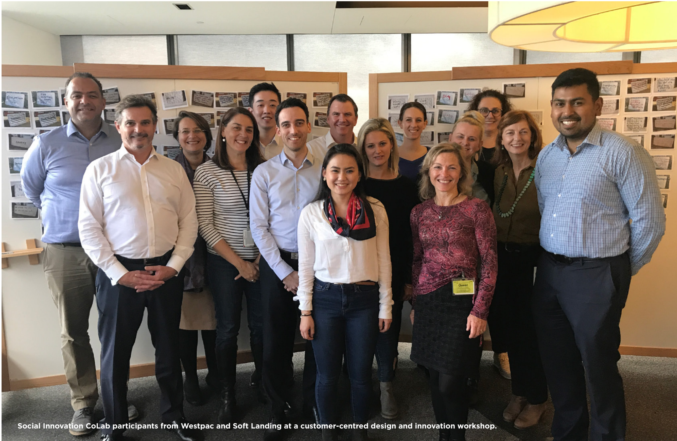
Social Innovation CoLab participants from Westpac and Soft Landing at a customer-centred design and innovation workshop.