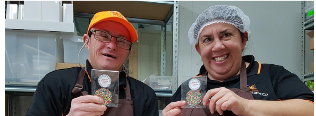
Team members from Mildura Chocolate Company (one of the five social enterprises run by The Christie Centre).

Together, these four organisations are forecast to create over 1,250 jobs and employment pathways for vulnerable Australians over the next three years.