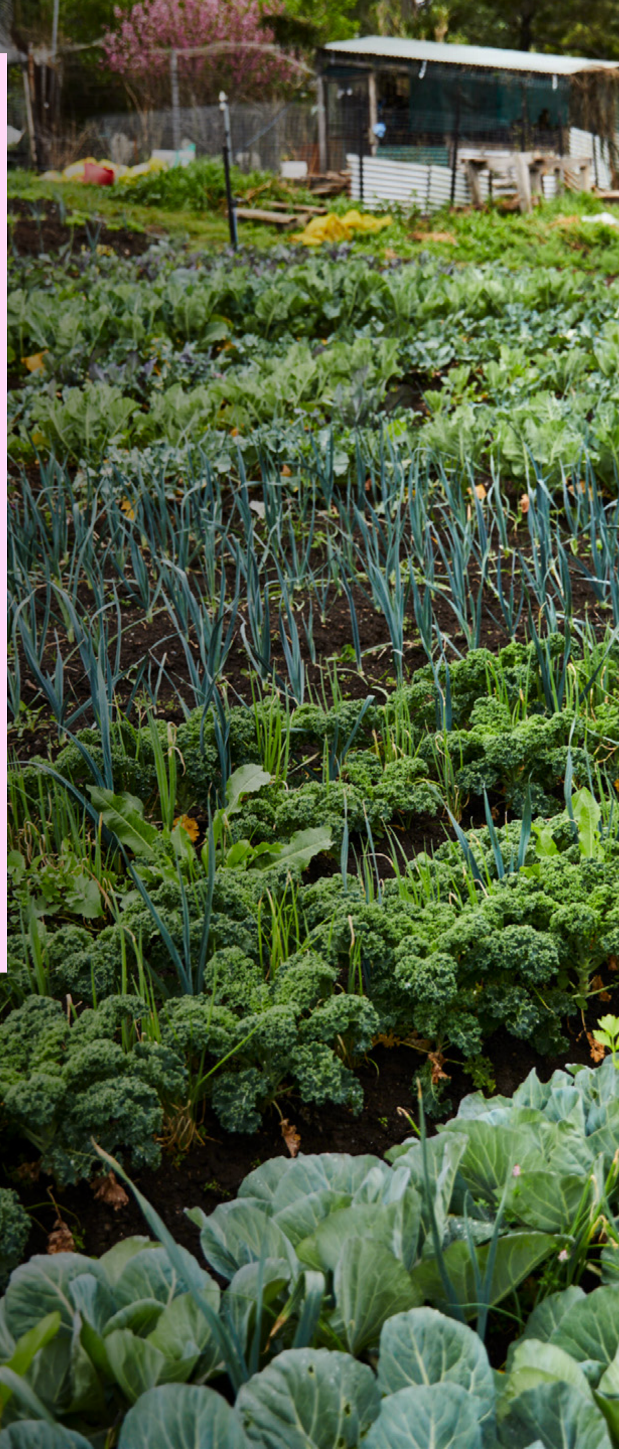
Green Connect farm in Wollongong

Established in 1879, Westpac Foundation has been helping people in need for over 140 years.