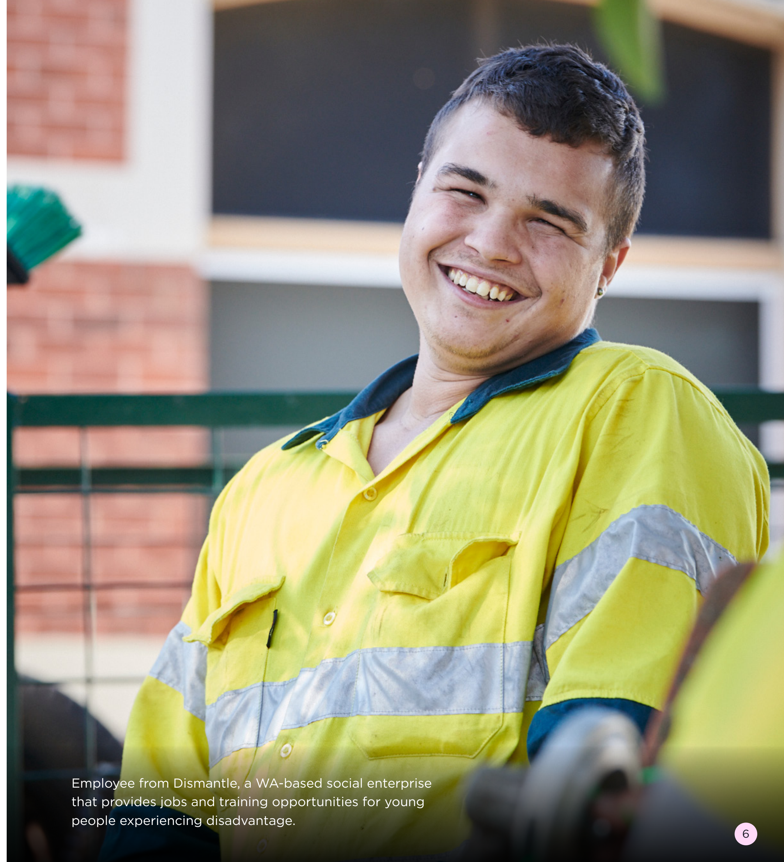
Employee from Dismantle, a WA-based social enterprise that provides jobs and training opportunities for young people experiencing disadvantage.