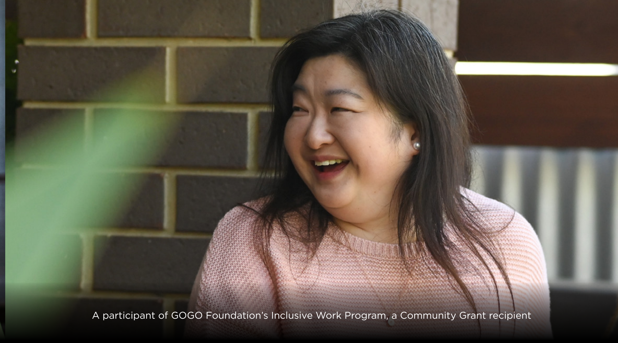
A participant of GOGO Foundation's Inclusive Work Program, a Community Grant recipient