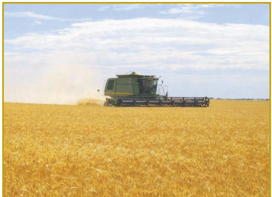
Wheat growers take the biggest hit this month with prices falling 8.4%.

Global wheat inventory levels have reached their highest